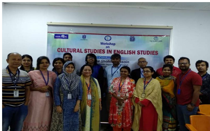
Workshop in the Department of English