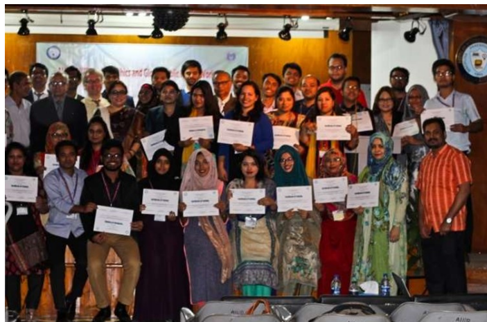
MPH Workshop on Bioethics & Global Public Health