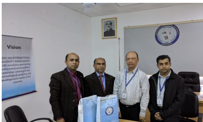
AIUB-IQAC Visited by Jessore University of Science and Technology (JUST) IQAC