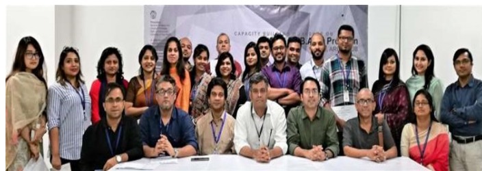
Workshop on OBE held at Architecture Department