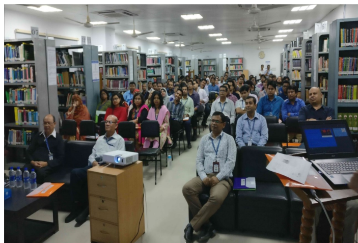
Capacity Building Workshop in Computer Science Department