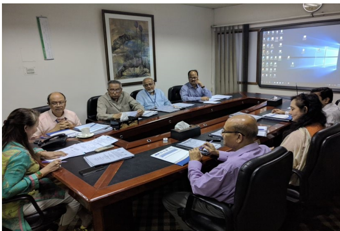
Quality Assurance Committee (QAC) Meeting