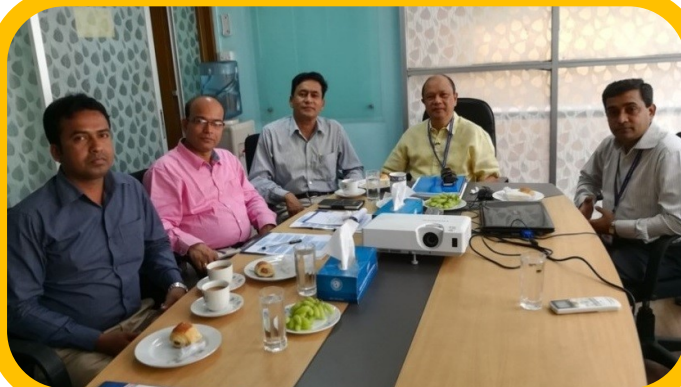
As a pioneer on Quality Assurance in Bangladesh, AIUB shares its experiences and practices in the operation of IQAC with other IQACs