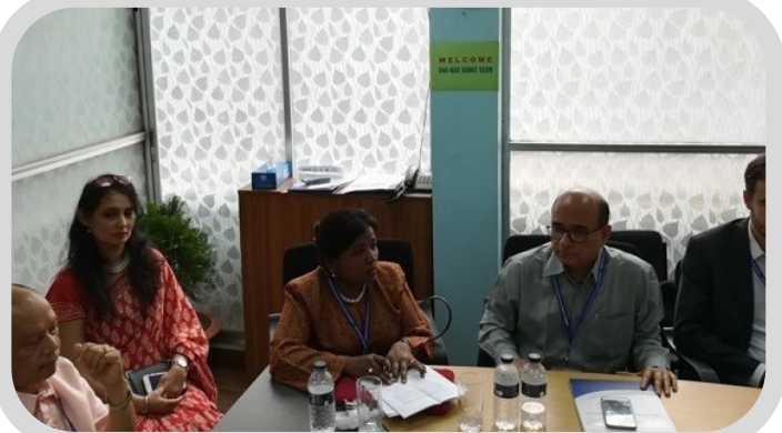
UGC-QAU Model Audit for AIUB-IQAC Operations