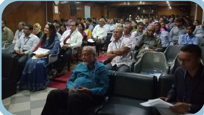
Orientation Workshop for 3rd Batch of Program Entities