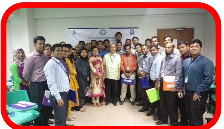
IQAC Initiated Internal Capacity Building Activities titled "Development Training Program for Administrative Officers"